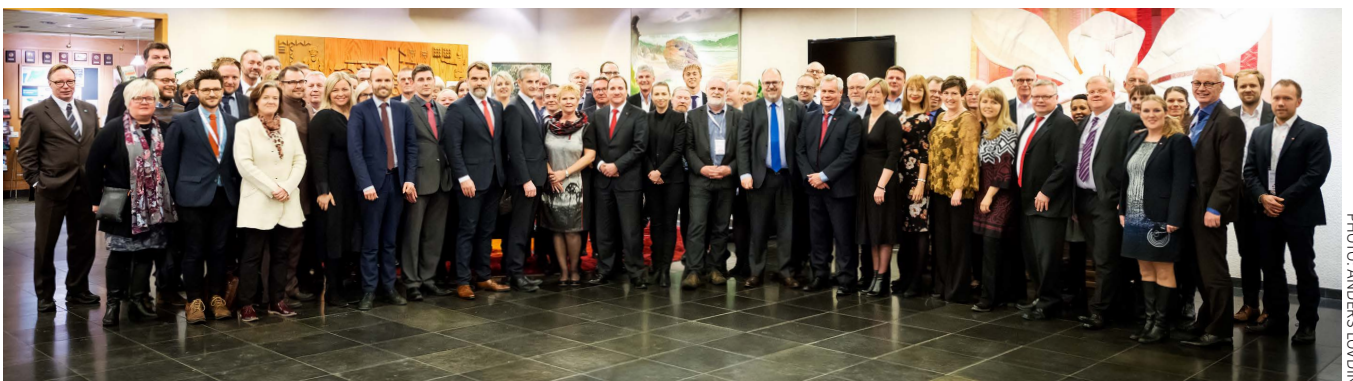
Delegates to SAMAK's Annual Meeting January 15 2016 at Rönneberga outside Stockholm, Sweden.