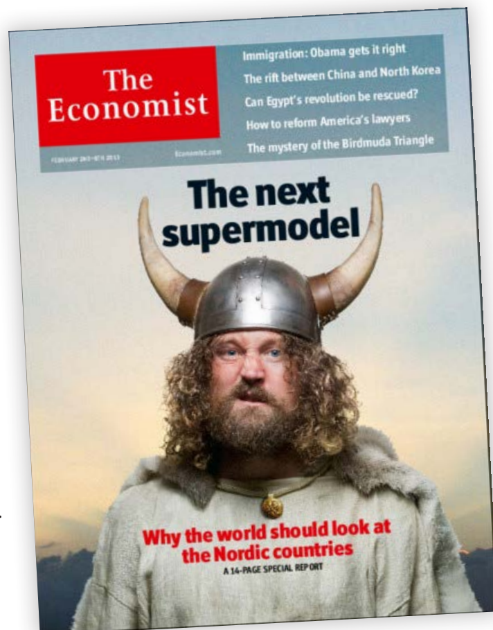
Front page of The Economist, February 2nd 2013.