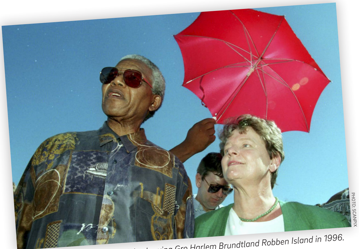
Sharing outlook: Nelson Mandela showing Gro Harlem Brundtland Robben Island in 1996.